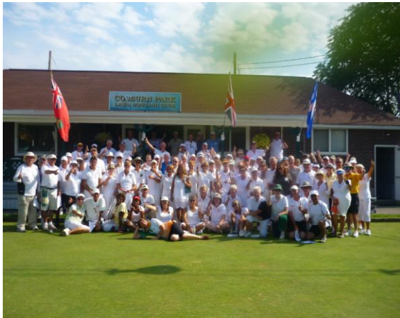
The Bren Macken Novice Tournament

Our 2011 Bren Macken Novice Tournament was held on August 27 at Cosburn, and with 90 novices competing (from 16 clubs across the province), this tournament is becoming the premiere Novice tournament in Ontario. With the unique format used for the jitney draw, no one knew who they would be playing with, which added to the excitement for the day.